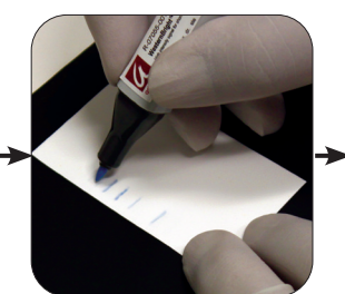
Annotate your blot. Mark the visible protein bands of the standard with WesternBright ChemiPen.